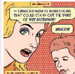
The Strip: 'Groundwater Follies'