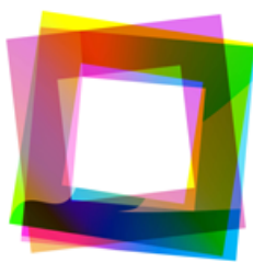
The Next Big Picture