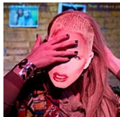
An 'Off the Wall' Experience at Don Pedro