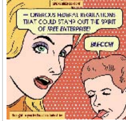
The Strip: 'Groundwater Follies'