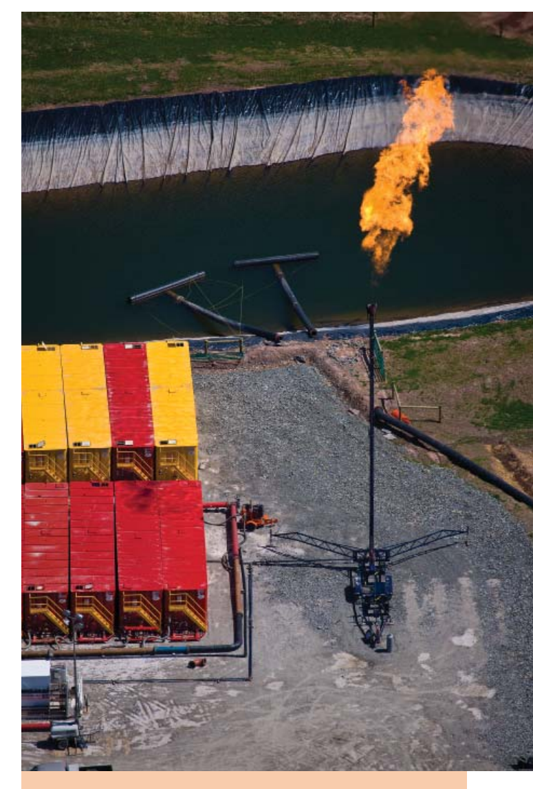
Flare at hydro-fracking gas drilling operations near Sopertown, Columbia Township, PA

A lender's title policy insures the mortgage lien, as of the date of the policy (up to the loan amount), against loss or damage if title is vested in someone other than the homeowner. Gas leases signed after the policy date are not covered by the policy. Gas leases in effect when the policy is issued will be listed as a title exception. Coverage won't include the gas lease or any claims arising out of it. Title endorsements don't eliminate this exception to coverage. Underwriters consider these exceptions a red flag, sufficient to jeopardize the loan. Lenders financing properties subject to compulsory integration won't discover the title encumbrance from a title search because ECL § 23-0901 makes no apparent reference to recording the DEC determination of compulsory integration in the land records. New York title policies expressly exclude from coverage loss or claims relating to any permit regulating land use. It remains unclear