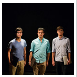
Yale Students in Tangle Over Website