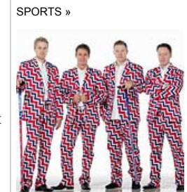
Encore, for a Curling Team and Its Pants

Why the president must be able to make recess appointments.